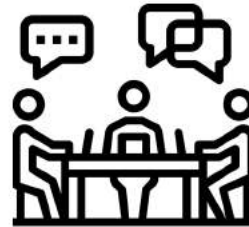
Board of Trustees